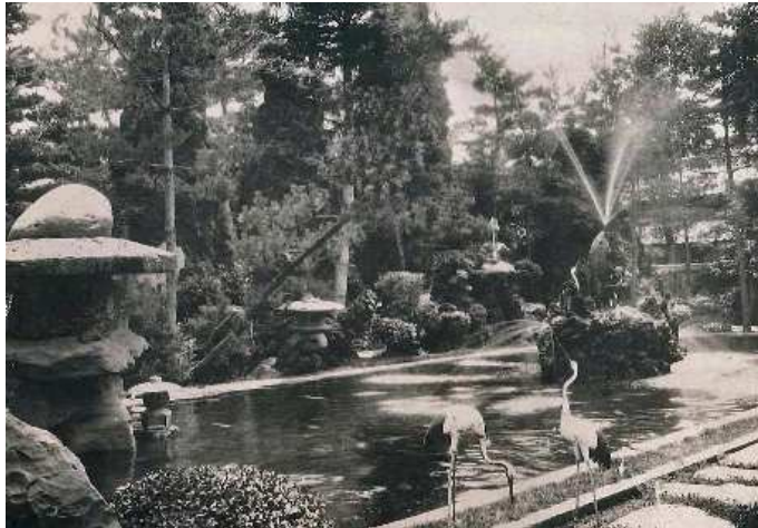
Pond In old days