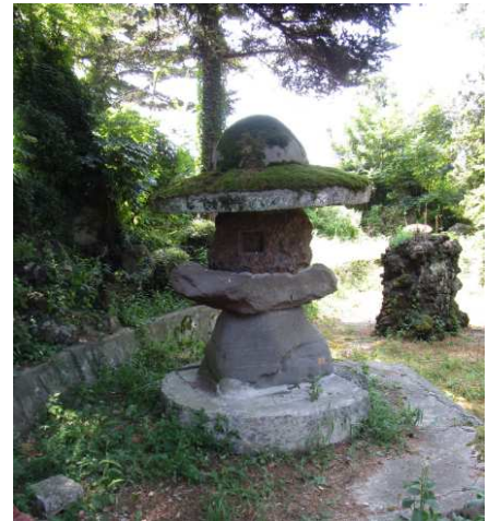
Pond in current state